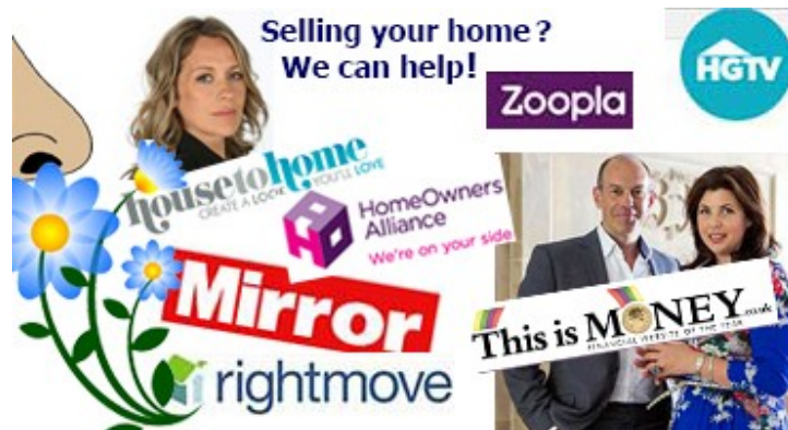
Selling your home? Mixed views on flowers & odours