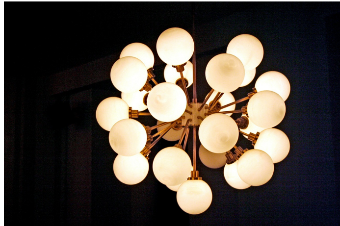
Artificial light helps you out if the real thing’s in short supply ...

The Daily Mail has a minimal “buying new/brighter lights/bulbs” tip.