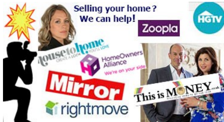
Why is there no advice on photography in their property guides?