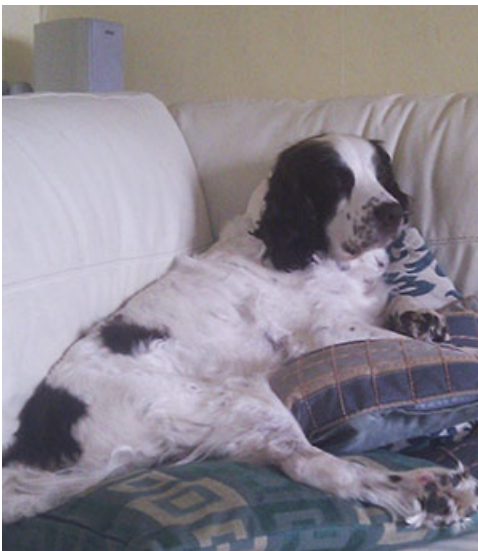
You may love your dog, but their smell lingers ...

When your house goes on the market it can be easy to concentrate on the look of the place, as this is obviously vital when the photos are being shot. And the photos are genuinely how potential buyers first meet your home.