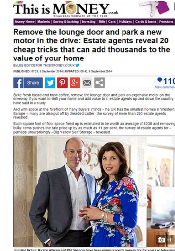
The Daily Mail's This is Money