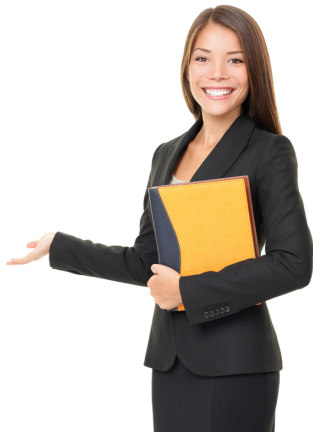
Why bother fixing your home when pretty estate agent will do the job?

There's 'leftfield', and then there's The Mirror