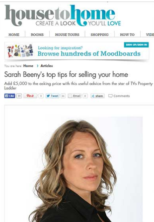
House to Home