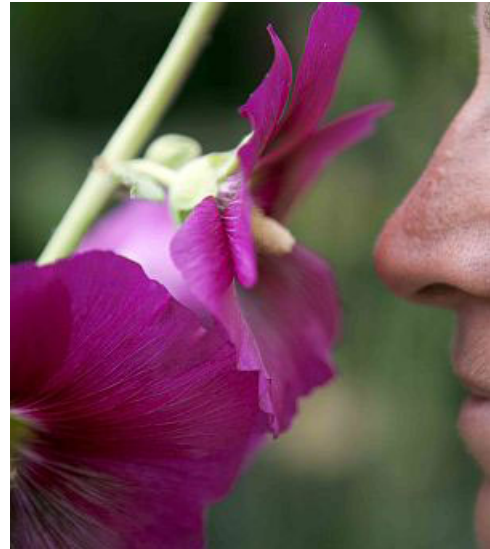
Flowers look good and are a recommended sales tool!

In the next chapter: Step 3: Light and Bright