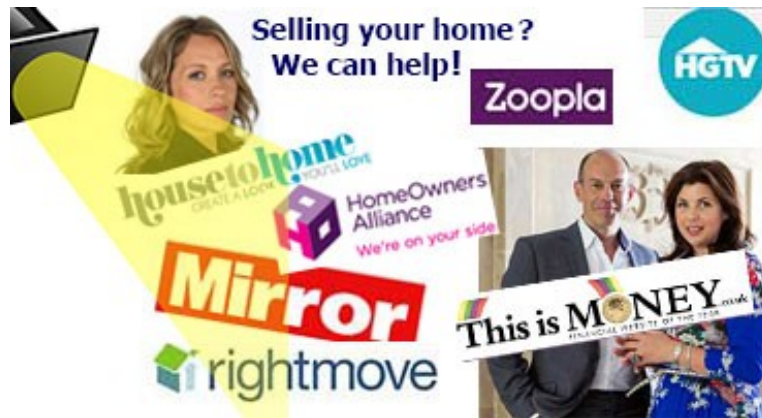
Illustration 1: If you've got nothing to hide, light it up!