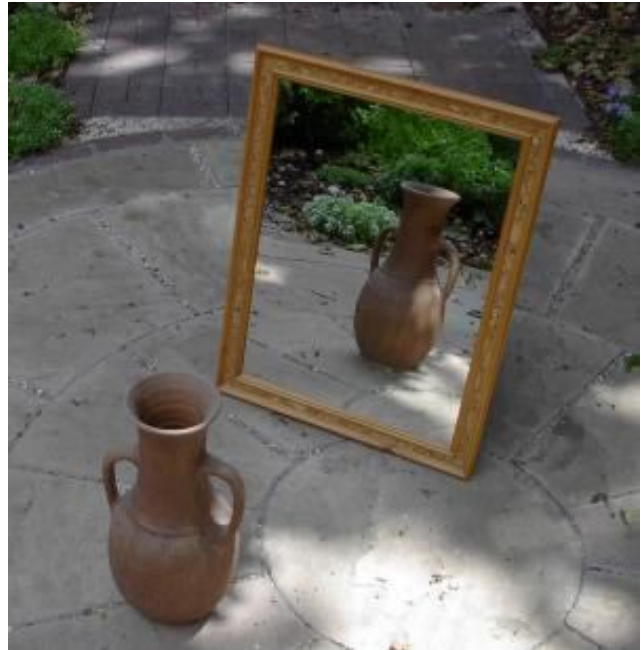
"Mirror" by Cgs - English Wikipedia

At the end of these brightening tips, you will have light streaming in through clean windows into your airy home, glinting off gleaming mirrors and any dark spaces lit up with lamps that show that your home has nothing to hide.