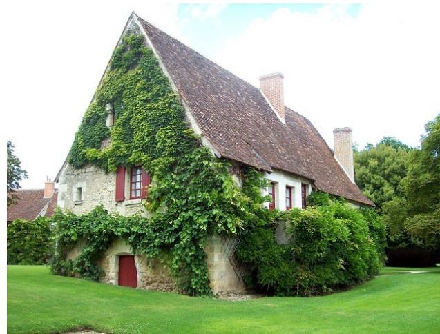
Your home: spruced up and ready to market!

... and that's just about the end of the first stage.