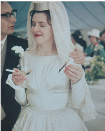
Is this 60s wedding photo too personal?

There is some debate about this one – most suggest brutally de-personalising before you attempt to sell, but HomeOwnersAlliance suggest deliberately personalising , but only in a way that shows your life in the home was fantastic and that anyone who buys will have that too.