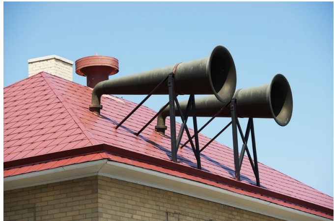
Install an integrated sound system?

Suffice to say, if you knock down your interior walls, convert your attic, build a conservatory and dig out a basement you will definitely need to add to your selling price to pay for it all!