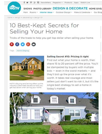
Home & Garden: HGTV