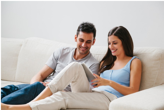
The Internet makes photos even more important when selling your home