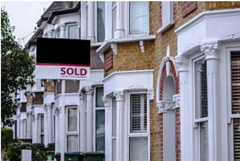
Follow the expert guides for a successful result

When you sell your home, you will also probably need to buy another – unless you don't mind renting for a while. If you move around a lot, owning a home can definitely tie you down and renting is a much more flexible way to live.