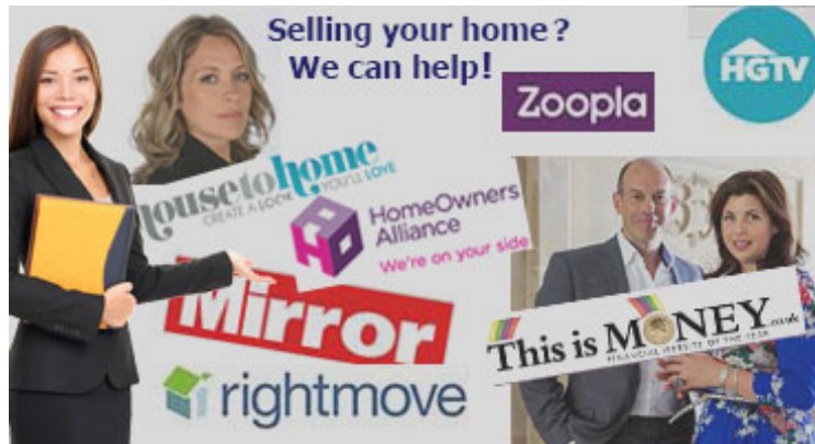
Time for the professionals – estate agents and solicitors