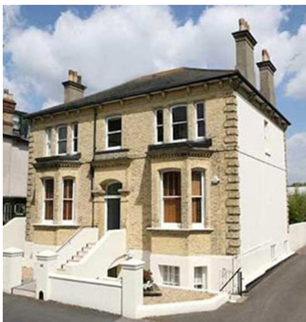
No cars, sunshine ... a perfect setting

A sunny day with no parked cars is definitely worth waiting for!