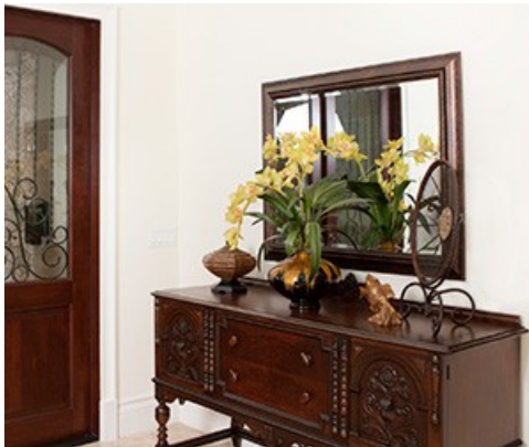
A mirror by the entrance is a great investment

Now you’ve organised and ditched all your rubbish, given everything a good clean, freshened up the paintwork and increased the amount of light falling on it all, why not make the whole property look bigger using mirrors?