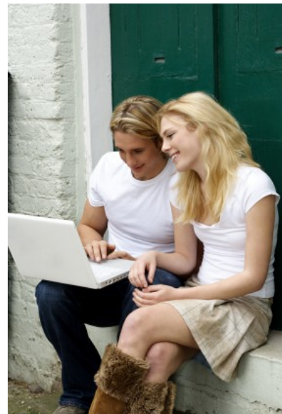
Buying your home: the modern way

A BEAUTIFUL COTTAGE NESTLING IN THE DOWNS