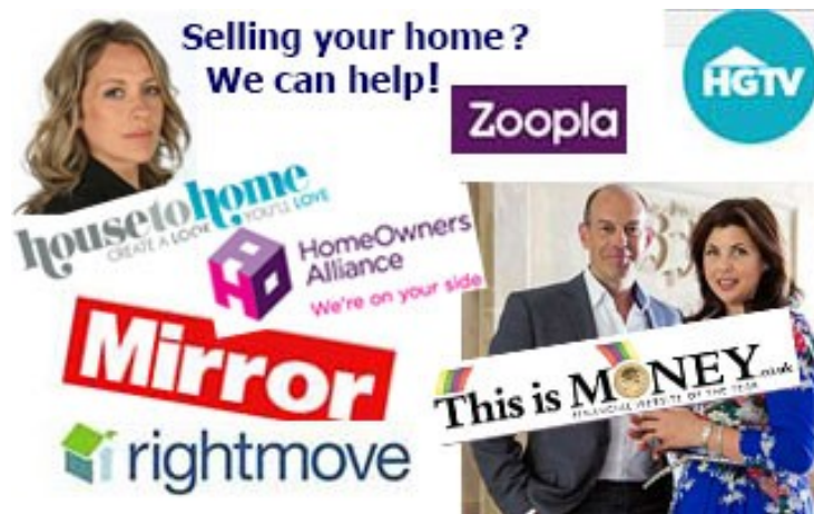
Selling your home – whose advice do you trust?