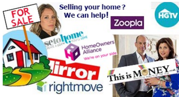
Your hard work is over: time for the market!