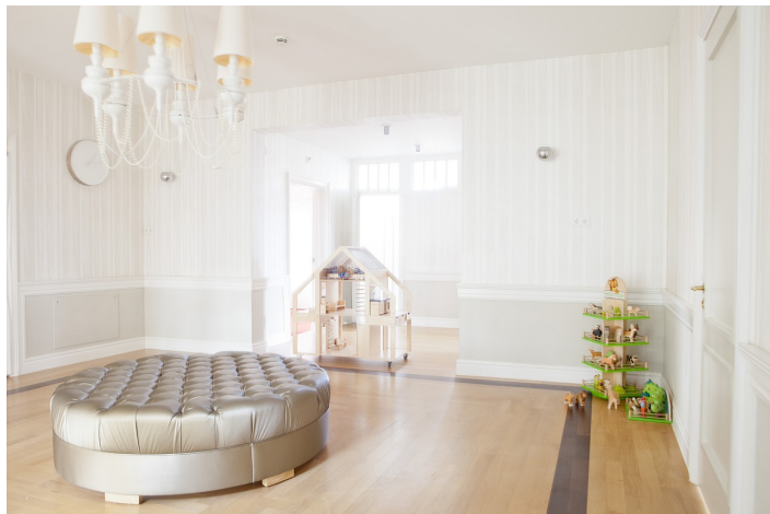
Property photographs are helpful to show the family after the viewing

With many estate agents spending no more than an hour with a camera at each property on their books, it can be worth taking a hand yourself. An hour could be enough, but often spending a day with a professional photographer can make all the difference.